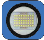
45pcs XML LED to provide 36000 lumens