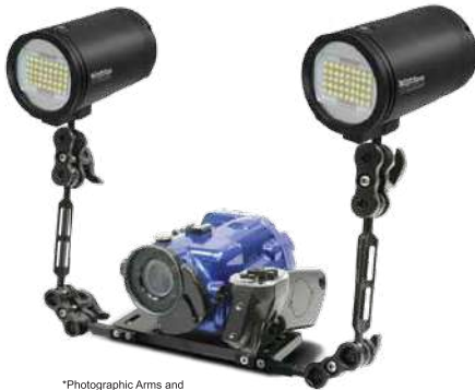
*Photographic Arms and Clips are sold separately