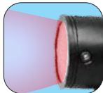
Built-in red color led enhances focusing performance